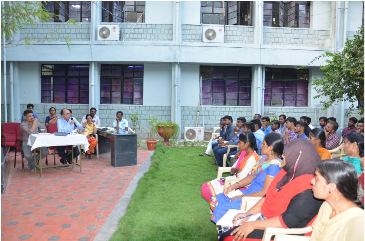
Director addressing the students